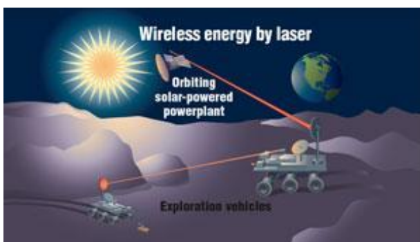
Fig. 1: Wireless energy by laser

The cost of launching a satellite into space is large. Maintenance of an earth based solar panel is relatively simple, but construction and maintenance on a solar panel in space would typically be done telerobotically. In addition to cost, astronauts working in GEO orbit are exposed to unacceptably high radiation dangers and risk and cost about one thousand times more than the same task done telerobotically. The space environment is hostile; panels suffer about 8 times the degradation they would on Earth.