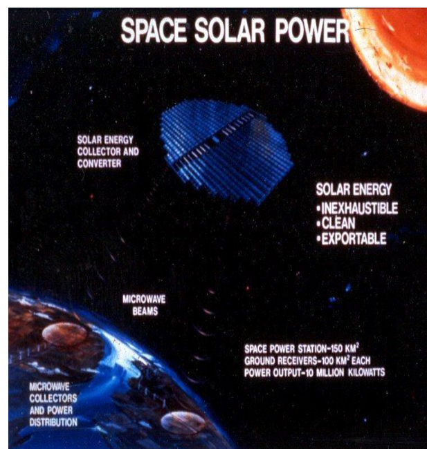
Fig. 2: Space solar power